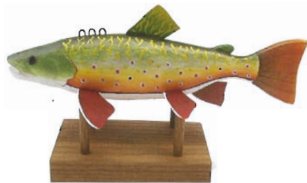
Brook Trout working decoy on walnut stand