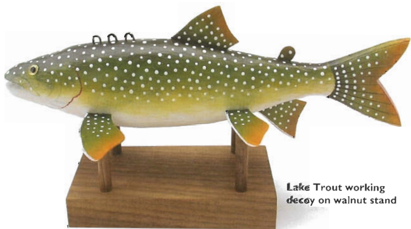
Lake Trout working decoy on walnut stand